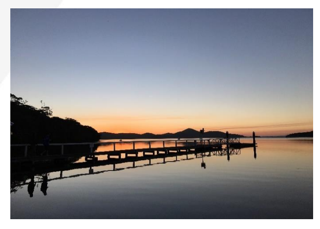
If you haven't travelled up the Mid North Coast of NSW, you should do yourself a favour and book a trip soon!

restaurants and cafes. A short drive South will see you at my personal favourite beach in Seal Rocks! Our whole area is connected by 3 lakes; Wallis Lake, Smiths Lake and Myall Lake, where the water is so clean they have set up a series of Oyster farms.